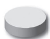
UNI CIRCULAR PALLET