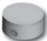
MAGNET CIRCULAR PALLET