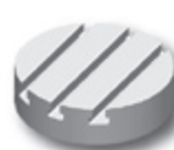
T-SLOT CIRCULAR PALLET