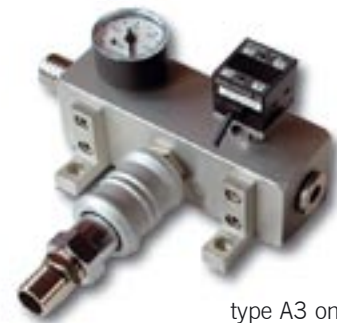
type A3 only

The range between high and low vacuum can be set stepless. In case of utilising a magnet valve the clamping process can be controlled directly from the machine control panel.